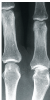
Figure 3: X-ray of MP joint arthritis. The joint on the right has no space between the bones when compared to the joint on the left because of cartilage loss

The diagnosis of arthritis is confirmed by taking x-rays. Figure 3 is an x-ray of a hand with arthritis: the x-ray shows narrowing of the space between the bones, which is a sign that cartilage has been lost.