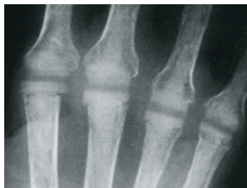
Figure 4: X-ray of silastic finger joint replacements

If the joint is completely destroyed, then joint replacement or joint fusion are effective surgical options. The joints can be replaced with